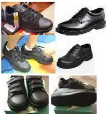
Examples of College approved school shoes: