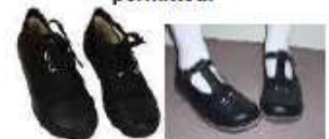
Examples of shoes that are not permitted: