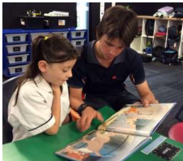
"Be the Light of Christ"

At Lumen Christi Catholic College, we do not hide our light under a bushel. We aspire to be the best that we can, learning to value God's gifts inspiring hope and serving others.